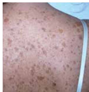
➤ Before treatment