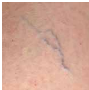
➤ Before treatment