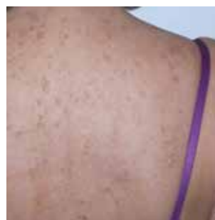
➤ After 10 days (in 1 session)

The EFB pulsed light energy provides the specific heat source necessary to locally reduce the excess of melanin in the skin to eliminate dark spots caused by ageing.