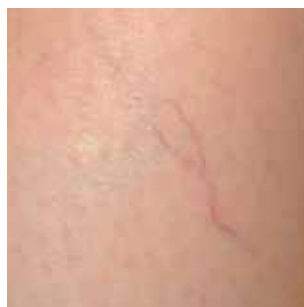
➤ After 2 sessions

The EFB beauté® filtered light provides the specific heat source required to contract small vessels and progressively ensure the disappearance of spider veins and telangiectasia.